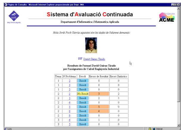
Fig 3. Student page.

Each exercise number is linked to the Exercise page .